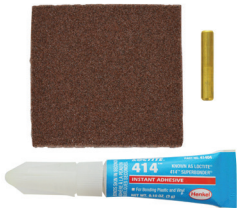
Repair Adhesive & Emery Cloth